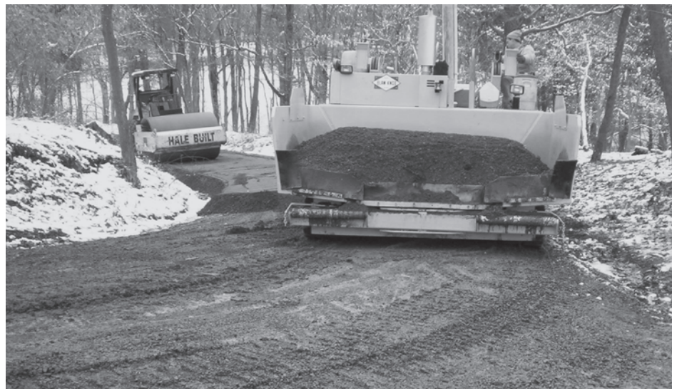
Federal stimulus funds allowed Lodi Hill Road, one of nineteen unpaved roads in the township, to be overlaid in recent months.

"The opportunity to participate in the improvement of our own township roads using local subcontractors and staff